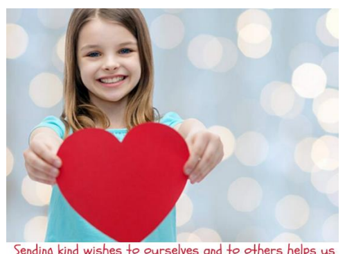
Sending kind wishes to ourselves and to others helps us feel better when we are down & nurtures compassion

Breathing is the heart of mindfulness. Breathing slowly and taking deeper breaths is a very effective tool to help lower symptoms of stress and anxiety, so you can be calmer and more relaxed.